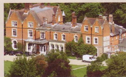
▲ Juniper Hall.